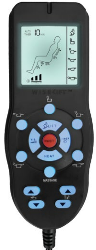
INDUSTRY LEADING REMOTE